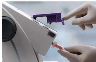
Easy to attach mixing tip without opening device cover.

The 3M™ Pentamix™ 3 Automatic Mixing Unit operates with push-button from either side. This makes it easy to use whether you are right- or left-handed. Effortless cartridge exchange and easy-to-attach mixing tips also increase procedure efficiency.