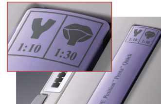
Product name and working/setting times are visible, even when the device cover is closed.