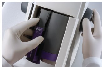
Easy cartridge exchange.