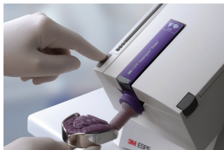
Push-buttons on left and right side allow for easy operation.