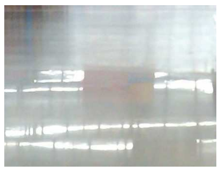
NOTE: In this image the concrete toward the front has a 60° gloss of 16.3 and a DOI of 80.9 with clearly reflected overhead lighting. The area in the rear has a 60° gloss of 16.4 and a DOI of 27.5 with overhead lighting visible only as a blur.