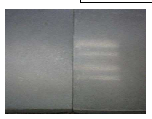
NOTE: The above picture shows two uncoated concrete tiles with similar 60° gloss (42 left and 49 right) but a different DOI (27 left and 75 right). Notice how the reflected lights are clear in the right hand tile and only a blurred image in the left tile

Distinctness of Image (DOI) is a measure of how crisp and sharply a reflected image appears. For example the ability to see a bright spot reflected in a floor as compared to being able to clearly see the outline of a light bulb or being able to read text in a reflected sign. Distinctness of image is an indication of the perfection of a reflection and lack of haze or orange peel in a surface. The picture used at the top of this Tech Talk is an example of a floor with a very high Distinctness of Image. In effect, a high DOI measurement tells us that light is perfectly reflected and only small amounts of light are reflected in angles close to perfect (which would cause a fuzzy image). Due to advances in portable meters, DOI is now being used in the field to measure the quality of floor coatings.