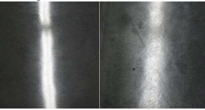
NOTE: The flooring on the left in the above picture was prepared using 3M™ Trizact™ Diamond TZ Abrasive Pads and has a 60° gloss of 78 and a DOI of 71. The flooring on the right was not prepared with 3M™ Trizact™ Diamond HX Discs and has a 60° gloss of 74 and a DOI of 43.

One of the major benefits of using 3M™ Trizact™ Diamond TZ Abrasive Pads prior to the application of a floor coating is a dramatic increase in DOI. Because Scotchgard™ Stone Floor Protectors are applied thin, it does not "orange peel" and is able to maintain the smoothness and DOI of the Trizact™ Diamond TZ Pad prepared flooring, while enhancing the gloss. Floors that have similar traditional gloss readings will have a better perceived appearance with the increased DOI provided by use of 3M™ Trizact™ Diamond TZ Abrasive Pads than those without. The following two images are provided to demonstrate the enhanced appearance of surfaces with similar gloss and different DOI values.