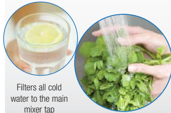
Filters all cold water to the main mixer tap