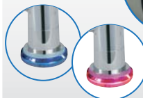
Change cartridge and battery when the indicator light turns red