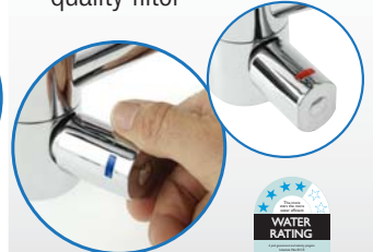
Change cartridge and battery when the indicator light turns red