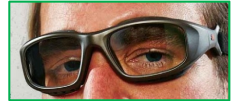
ZT35 Sealed Rx Eyewear

If Anti-Fog protection is needed on both sides of the lens, try our standard 3M Anti-fog coating