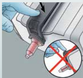
6. Close the latch with an audible click.