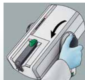
4. Turn the wheel (piston) forward.