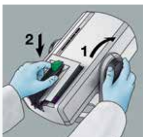
3. Insert the cartridge into the Pentamix™ Lite Automatic Mixing Unit.