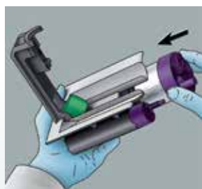
2. Insert Pentamix™ Foil Bag with the 3M ESPE impression material of your choice into the cartridge.