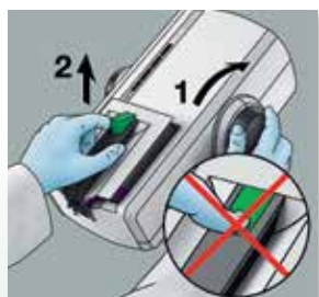
1. Remove the cartridge.