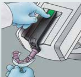
7. Press the green start button to fill the impression tray or elastomer syringe.