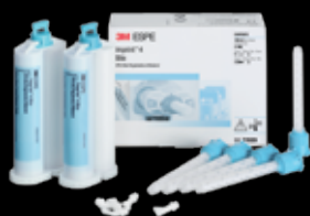
Imprint™ 4 Bite Refill (71529)