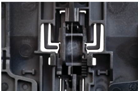
Diamond wire shuttle