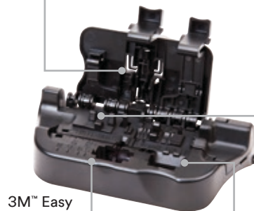
3M™ Easy Cleaver