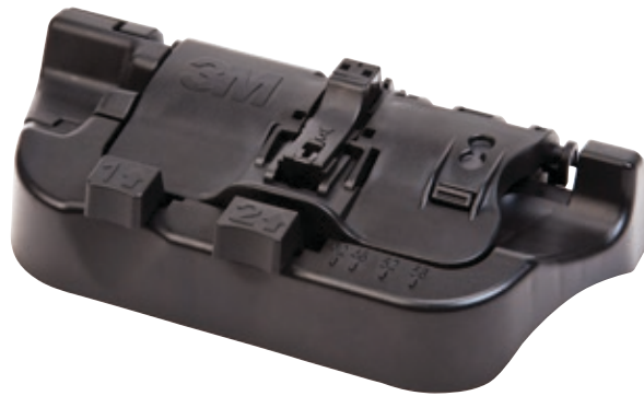
3M™ Easy Cleaver

*3M Easy Cleaver is included in select packages of 3M connectors and splices for a nominal increase in price. Use of the 3M Easy Cleaver with other manufacturers' connectors is not recommended and may void the warranty.