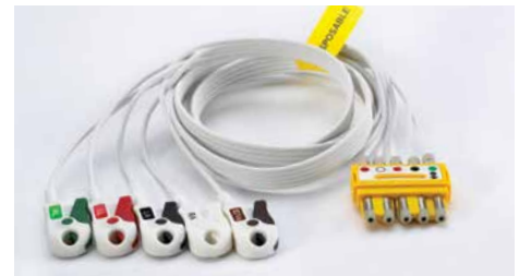
AMC&E 5-Lead Universal DIN to Pinch Disposable Leadwire with Shielded Ribbon Cable and Combiner YMDLW5P (shown below)

Standardize on one universal connection.