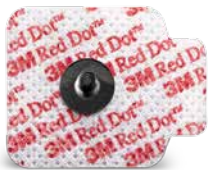
3M™ Red Dot™ Repositionable Monitoring Electrode 2670 – Radiolucent (shown above)