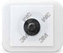
3M™ Foam Monitoring Electrode 2244 Radiolucent with Sticky Gel (shown above)