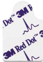
3M™ Red Dot™ Resting EKG Electrode 2360 Radiolucent

For EKG diagnostics typically done in the ER or EKG lab.