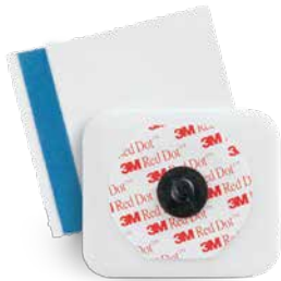
3M™ Red Dot™ Monitoring Electrode 2570 Radiolucent with Abrader, Foam Tape and Sticky Gel (shown above)