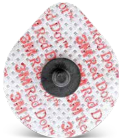
3M™ Red Dot™ ECG Monitoring Electrode 2268-3 Radiolucent