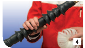
4 Once the inner core has been fully removed, the termination installation is complete!