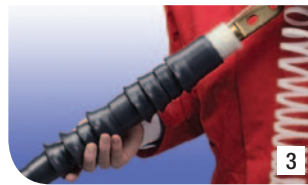
3 Begin to remove the inner core, allowing the termination to shrink down onto the cable