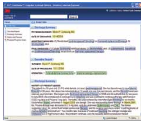
CAE colour differentiation: blue highlights the diagnosis, green the intervention and yellow the physicians and dates.

Leverage Your Current EHR Investment to Increase Coding Productivity