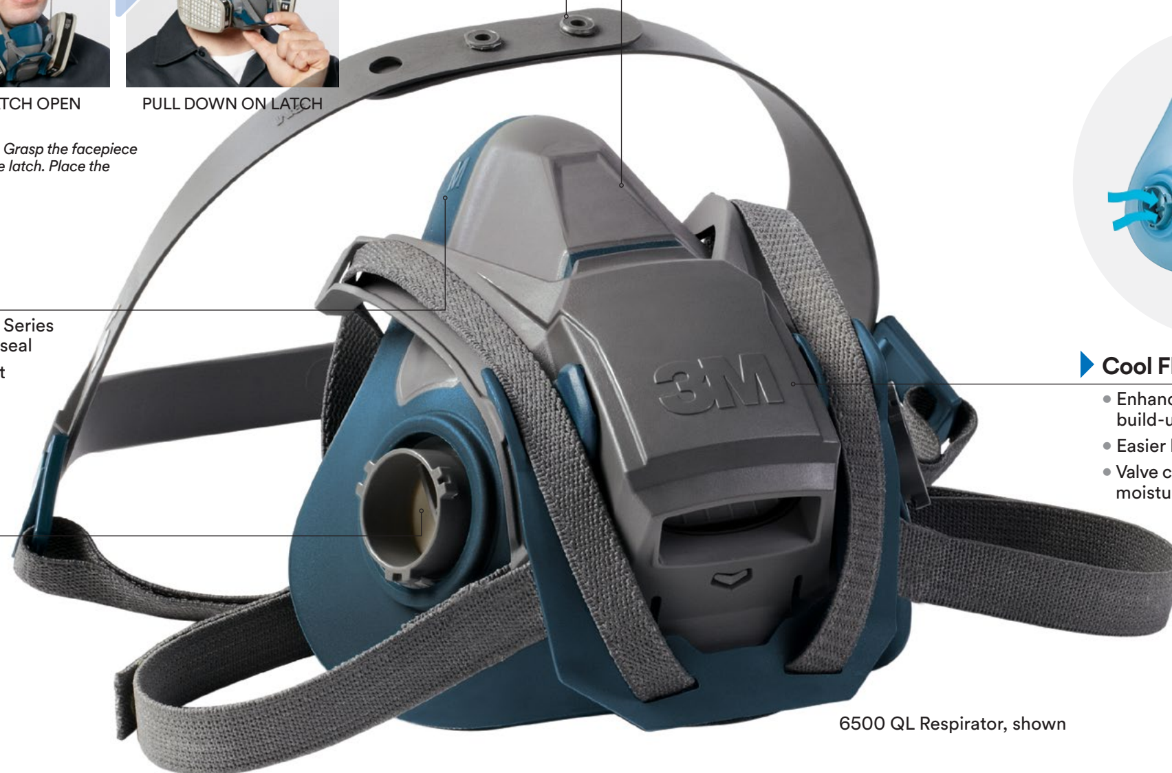
6500 QL Respirator, shown