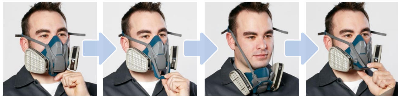
QUICK LATCH CLOSED