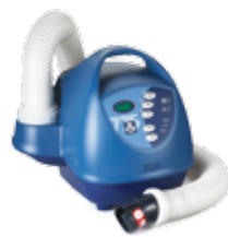
Warming Unit Model 77500

Dimensions: 13"h x 14"w x 13"d (33h x 36w x 33d cm)