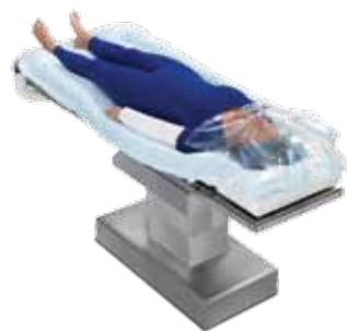
Full Access Underbody Blanket