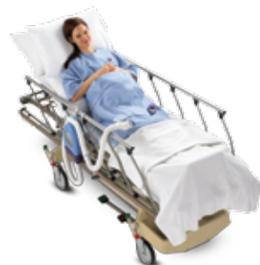
Patient Warming Gown

Operating Temperatures: ± 1.5°C High: 43°, Med: 38°, Low: 32°, Ambient