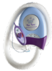
Warming Unit Model 87500

Dimensions: 13" h x 7.7" w x 4" d (33h x 19.6w x 10.2d cm)