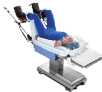
Lithotomy Underbody Blanket