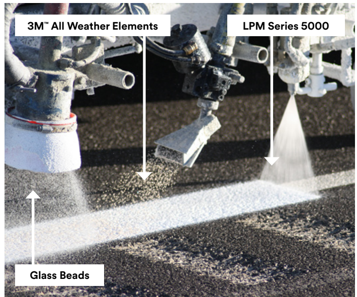
3M™ Liquid Pavement Marking Series 5000 with optional 3M™ All Weather Elements.

3M is a global company with local support. Our experienced representatives and technicians can show you how to improve roadway visibility and safety, reduce long-term costs, properly apply pavement marking materials, and maintain your roadway marking projects.