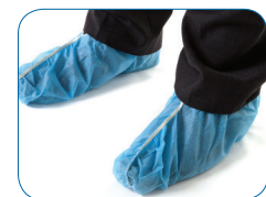
3M™ 402 Overshoe

3M New Zealand Limited 94 Apollo Drive Auckland 0632 TechAssist Helpline: 0800 364 357 Customer Service: 0800 252 627 Website: 3m.com/nz/ppesafety