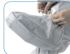
3M 450 Overboots