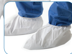
3M 442 Overshoe