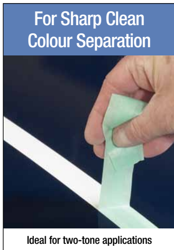
For Sharp Clean Colour Separation