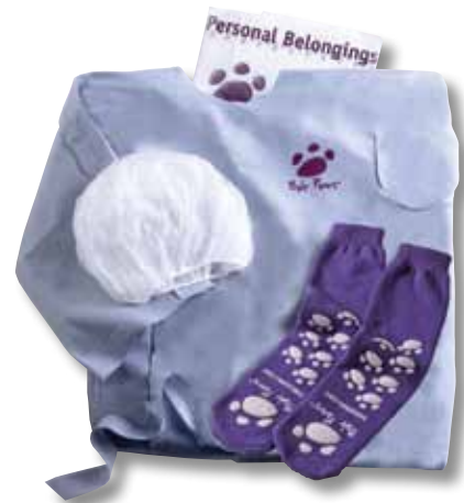
Gown kit includes patient warming gown, bonnet, booties, personal belongings bag and shoe bag.