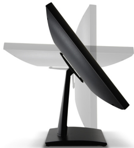
90-degrees of Adjustment