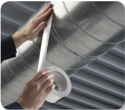
With aggressive adhesive and dead soft aluminium, Scotch® Foil Tape 3311 seals and secures seams and joints for long term durability. UL 733 listed for duct sealing and general repairs.