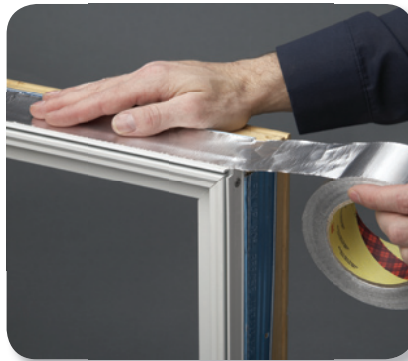
3M™ 425 Aluminium Foil Tape seals out water and moisture from joints in this window sash.