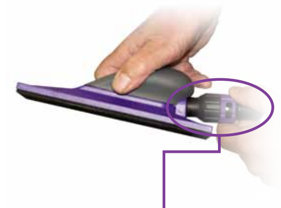
Adjustable air management valve with every tool

The new range of accessories has been ergonomically designed to offer the most comfortable lightweight solution for every application.