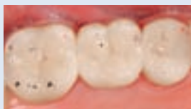
Posterior 3-unit Lava™ Bridge at 2 year recall with contact points marked.

Minor Chipping (n): 4 Major Chipping (n): 2 Replacement (n): 2