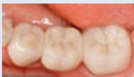
3-unit posterior Lava™ Bridge, 5 years in situ .