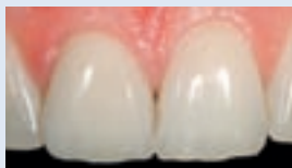
Lava™ Crown on upper right central incisor at 2 year recall.

Minor Chipping (n): 0 Major Chipping (n): 0 Replacement (n): 0