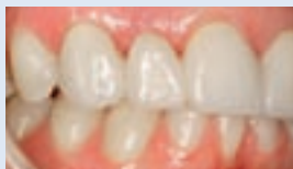
3-unit anterior Lava™ Bridge at 2 year recall.