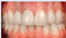
Anterior Lava™ crowns (upper right lateral and 2 upper central) at baseline.

Minor Chipping (n): 1 Major Chipping (n): 0 Replacement (n): 0