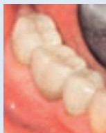
Posterior 3-unit Lava™ Bridge at 3 year recall.

Minor Chipping (n): 2 Major Chipping (n): 0 Replacement (n): 0