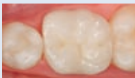
Posterior Single-unit Lava™ restoration at baseline.