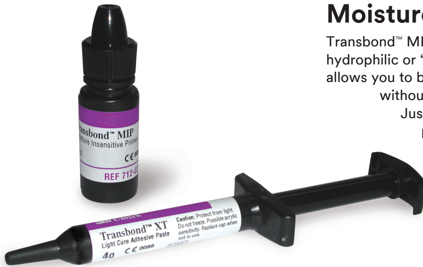
Adhesive Bond Strength at 24 hours* Transbond™ MIP Primer vs Transbond™ XT Primer