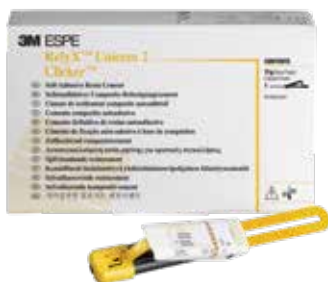
RelyX™ Unicem 2 Clicker™ Dispenser Refill – A2 (56875)