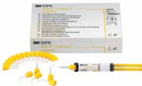
RelyX™ Unicem 2 Automix Cement Refill – A2 (56846)