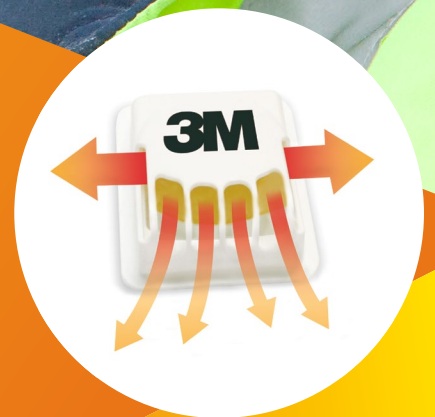
3M™ Cool Flow™ Valve

When working in hot and humid environments, finding both reliable and comfortable respiratory protection is key to helping keep workers safe. With 3M disposable respirators there's a solution: 3M™ Cool Flow™ Valve technology.