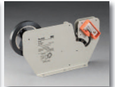
Scotch® Bag Sealer P400 applies tape in an adhesive-to-adhesive flag seal, includes bag trimmer.