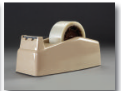
Scotch® Heavy-Duty Tabletop Dispenser C22 for pull and tear convenience.