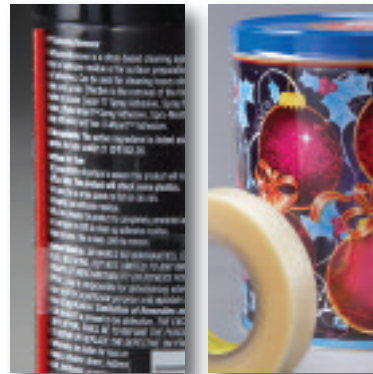
Attach applicator tube to aerosol can with Scotch® Transparent Film Tape 600.