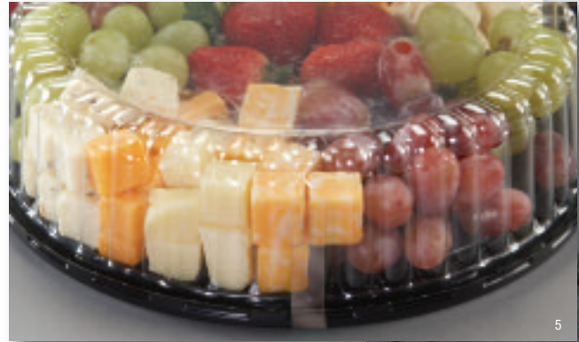
Hold plastic party tray lid with Scotch® Transparent Film Tape 605