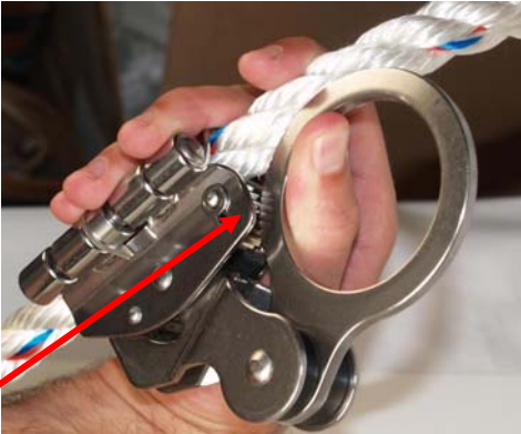
Anti-Panic Lock Cam Engaging 5/8" Rope, preventing "Death Grip"