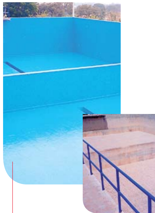
A filter tank for potable water relined with 3M™ Scotchkote™ High Performance Flexible Polyurethane Lining System Chemi-Tech PU 995 - formerly Thortex Chemi-Tech PU, a solvent free, fast curing, and potable water approved coating.

This Bio Gas digester hole suffered severe chemical attacks. The external surfaces were coated with 3M™ Scotchkote™ Polymer Cement Wall-Tech CWC 423 - formerly Thortex Wall-Tech CWC used to provide a barrier against subsurface water on concrete surfaces. The substrate was primed with 3M™ Scotchkote™ Solvent Free Epoxy Floor Primer Floor-Tech SP Primer 810 - formerly Thortex Floor-Tech SP Primer which offers excellent adhesion to concrete and lined with 3M™ Scotchkote™ Solvent Free Epoxy Chemi-Tech EP 970 - formerly Thortex Chemi-Tech EP, to provide ultimate protection against chemical attacks.