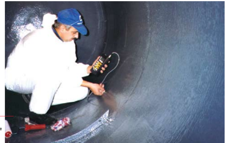
This sugar tank was lined with 3M™ Scotchkote™ Solvent Free Epoxy 175 - formerly Thortex Chemi-Tech UC, an Ultimate Epoxy Chemical Resistant System.