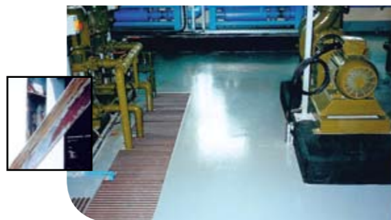
The containment area around these chemical tanks protected with 3M™ Scotchkote™ Solvent Free Epoxy 175 - formerly Thortex Chemi-Tech UC which was the only product that would withstand the complex mixture of aggressive chemicals.