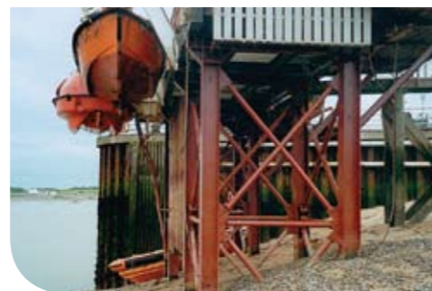
Offshore training rig supports coated with 3M™ Scotchkote™ Solvent Free Epoxy 151UW - formerly Copon Hycote 151E, a corrosion resistant lining for underwater environments.