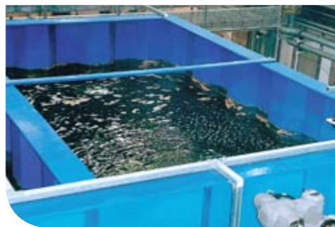
3M™ Scotchkote™ Solvent Free Epoxy Chemi-Tech CR 960 - formerly Thortex Chemi-Tech CR, delivers long-term free corrosion protection for the internal and external metal surfaces of this slurry tank.