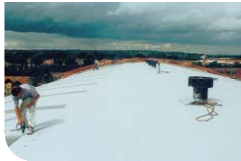
3M™ Scotchkote™ Solvent Based Epoxy Corro-Tech GP 120 - formerly Copon Surtol & 3M™ Scotchkote™ Solvent Based Polyurethane Uni-Tech UV 840 - formerly Thortex Uni-Tech UV.