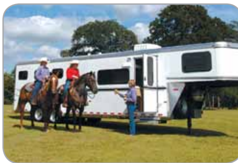
Ideal for paint bake operations.