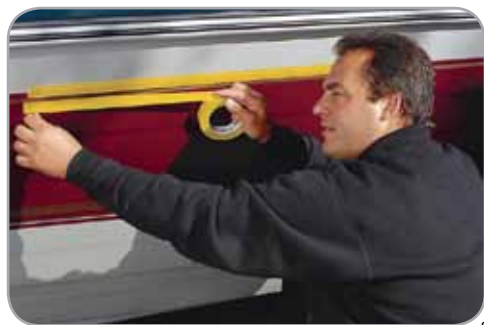
Creating long, straight paint lines is easy.