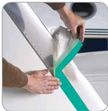
Excellent adhesion to smaller gross masking papers.