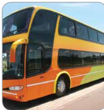
Unique hybrid technology combines the long, straight lines of flatback tapes with the sharp, exceptionally low paint edges of fine line.