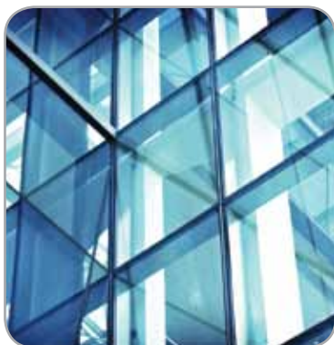
Strong enough to pull through window glazing caulk for a neat, crisp edge.