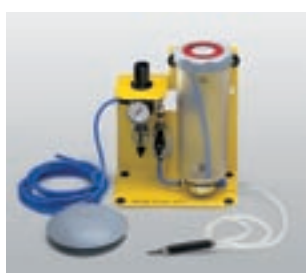
Junior Blasting Module