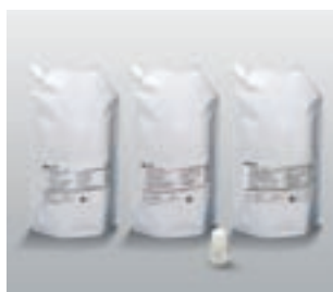
Rocatec™ Bags and Primer

*For more information or to place an order for Rocatec™, please contact your 3M ESPE contact.