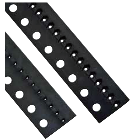
3M™ Polycarbonate Ultra Precision Carrier (UPC) 3000UB

3M carrier 3000UB is designed to provide tighter pocket dimensional tolerances of \pm 0.03 mm for A_o , B_o , K_o dimensions and small sidewall draft angles, which allows for better component in pocket fit (part capture) and registration. Additional features consist of a reduced pocket hole (D1) of 0.15 mm to draw vacuum for small component loading applications, combined with flat pocket bottoms, will effectively help reduce component rotation, tilting and flipping concerns for improved throughput.