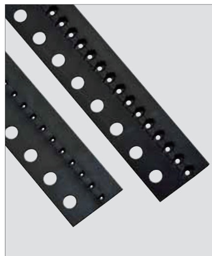
3M™ Polycarbonate Ultra Precision Carrier (UPC) 3000UP

3M carrier 3000UP is designed to provide tight pocket dimensional tolerances of \pm 0.03 mm for Ao, Bo, Ko dimensions and small sidewall draft angles, which allows for better component in pocket fit (part capture) and registration. Additional features consist of a reduced pocket hole (D1) of 0.15 mm to draw vacuum for small component loading applications, combined with flat pocket bottoms, will effectively help reduce component rotation, tilting and flipping concerns for improved throughput.