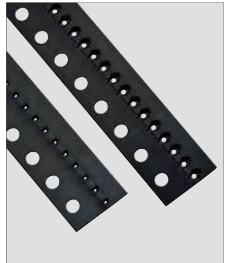
3M™ Polycarbonate Ultra Precision Carrier (UPC) 3000UP

3M carrier 3000UP is designed to provide tight pocket dimensional tolerances of \pm 0.03 mm for A_o , B_o , K_o dimensions and small sidewall draft angles, which allows for better component in pocket fit (part capture) and registration. Additional features consist of a reduced pocket hole (D1) of 0.15 mm to draw vacuum for small component loading applications, combined with flat pocket bottoms, will effectively help reduce component rotation, tilting and flipping concerns for improved throughput.