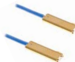
3M™ Shielded Controlled Impedance (SCI) Cable Assembly