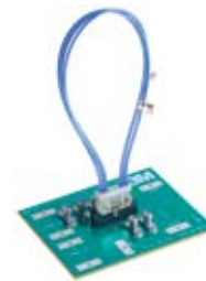
3M™ Shielded Controlled Impedance (SCI) Cable Assembly 2 mm Latch/Eject Development Kit