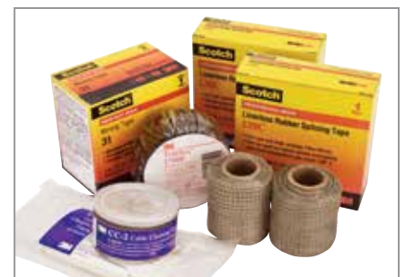
3M™ Mining Cable Splice Kit 3104