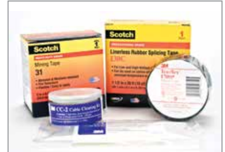
3M™ Mining Cable Splice Kit 3100