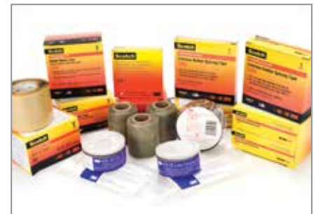
3M™ Mining Cable Splice Kit 3103