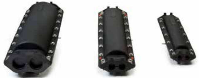
3M™ Pressurized Closure System 51P Series