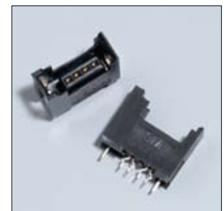
3M™ Mini-Clamp Boardmount Connectors, 4-pin single row