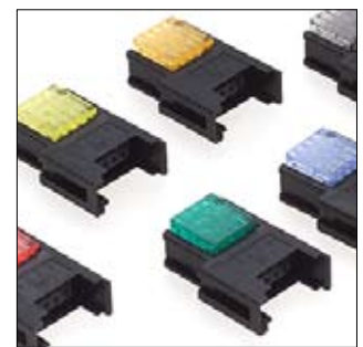
3M™ Mini-Clamp Socket Connectors