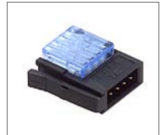
3M™ Mini-Clamp Plug Connector