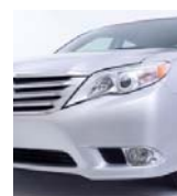
Hood Leading Edge