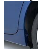
Rear Quarter Panel