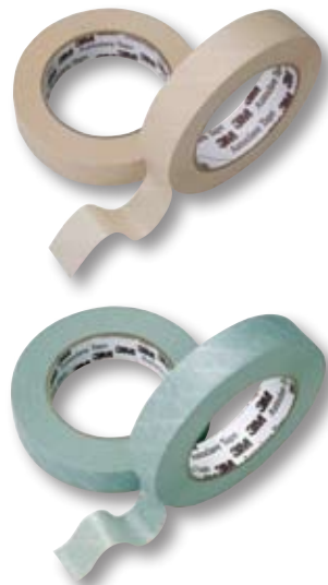
3M™ Comply™ 1222 (tan) and 1255 (blue) Indicator Tapes for Steam

3M™ Comply™ Indicator Tapes for steam sterilization are reliable process indicators. The chemical indicator stripe on 3M™ Comply™ 1255 indicator tape will turn light to dark for easy identification when exposed to a steam sterilization oxide process. These products are simple to apply and the reliable high tack adhesive adheres well to packaging material. 3M™ tape dispensers models C22 and M920 provide convenient dispensing of 3M™ Indicator Tapes.