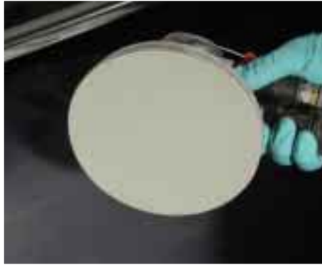
Using a Soft Interface Pad 05774 increases the ability to sand contours.