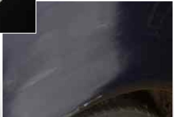
The uniform matt finish is ready for painting.