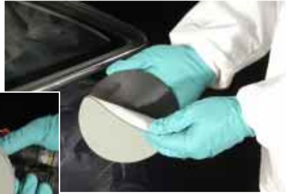
Fitting the Blending Disc to a Hand Pad for hard-to-reach areas – the pad has a rear strap to fit over the operator's hand.

The Blending disc should be dampened with water (not solvent) before use. Conformability is achieved through the unique foam construction of the product, allowing even pressure to be applied in both machine and hand applications when sanding deep into orange peel pockets. The result being a quality, uniform matt finish that is now ready for painting.