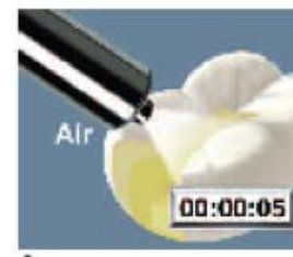
Step 2. Dry the adhesive for 5 seconds.