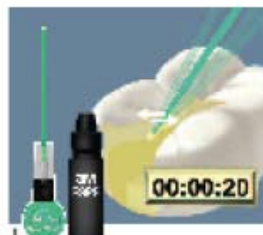
Step 1. Apply adhesive to tooth surface for a total of 20 seconds.

The following illustrates how simple it can be using Adper Easy Bond adhesive for direct light-curing restoration, whether using our convenient, disposable Unit Dose applicator or bottle.