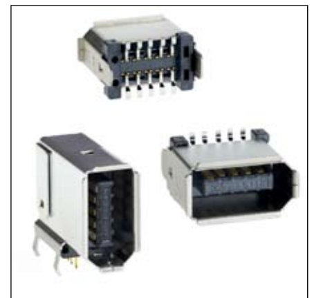
3M™ Shielded Compact Ribbon (SCR) Boardmount Connectors