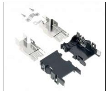
3M™ Shielded Compact Ribbon (SCR) Shell Kits