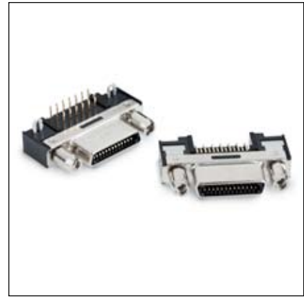
3M™ Shrunk Delta Ribbon (SDR) Connector