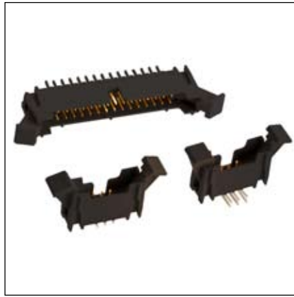
3M™ Latch/Eject Header, 2 mm

***RoHS Compliant 2005/95/EC** means that the product or part ("Product") does not contain any of the substances in excess of the maximum concentration values in EU Directive 2002/95/EC, as amended by Commission Decision 2005/618/EC, unless the substance is in an application that is exempt under EU RoHS. This information represents 3M's knowledge and belief, which may be based in whole or in part on information provided by third party suppliers to 3M.