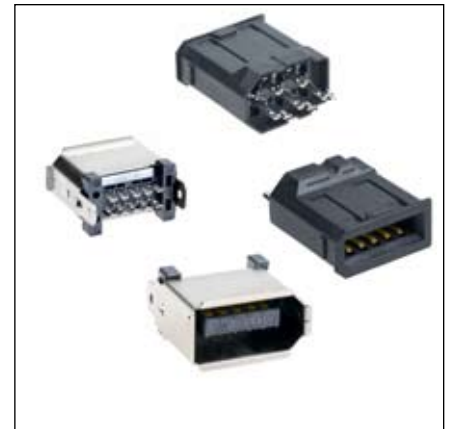
3M™ Shielded Compact Ribbon (SCR) Wiremount Connectors