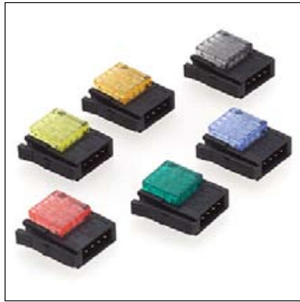
3M™ Wiremount Connector, Mini-Clamp Plug