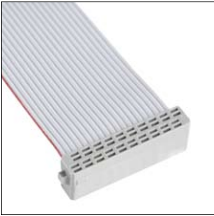
3M™ Molded-On Cable Assembly, 2 mm