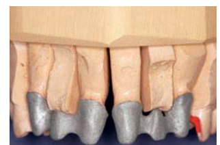
Fig. 8: Bridge frameworks on master model, buccal view