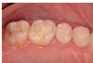
Fig. 1: Initial situation – tooth 26 temporarily restored with Filtek Supreme XT restorative

The impression for the temporary crown was made with the 3M™ ESPE™ Position™ Tray and with Position™ Penta™ Vinyl Polysiloxane Preliminary Impression Material. Crown temporary was made with 3M™ ESPE™ Protemp™ 3 Garant™ Composite for Temporary Crowns and Bridges, and cemented with 3M™ ESPE™ RelyX™ Temp NE Temporary CementZinc Oxide (Non-Eugenol). Final Lava crown restoration (Fig. 7, 8) was permanently cemented with 3M™ ESPE™ RelyX™ Unicem Self-Adhesive Resin Cement.