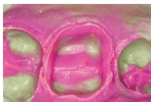
Fig. 6: Close-up Express 2 Penta H Quick & Express 2 Light Body Standard Quick Impression Material