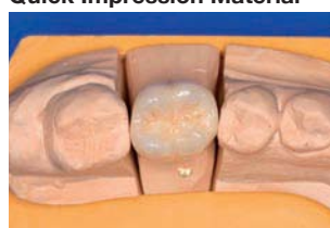
Fig. 11: Final Lava™ Crown on split cast model, occlusal view