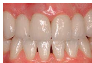
Fig. 11: Final restoration inserted in mouth, buccal view