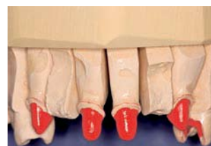
Fig. 7: Split cast model, prepared, buccal view