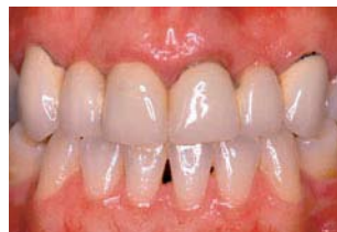
Fig. 2: Close-up initial situation – insufficient PFM bridges