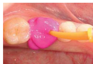
Fig. 8: Intra-oral syringing with Express™ 2 Light Body Standard Quick 2-step Impression Material