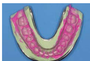
Fig. 9: Express™ 2 Penta™ H Universal Quick & Express™ 2 Light Body Standard Quick 2-step Impression Material