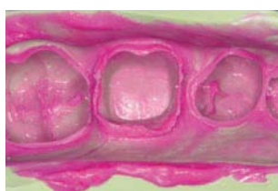
Fig. 10: Close-up 2-step impression Express™ 2 Penta™ H Universal Quick & Express™ 2 Light Body Standard Quick Impression Material