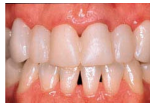
Fig. 3: Close-up Protemp™ Temporary in mouth