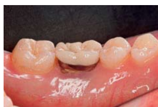
Fig. 1: Initial situation – Insufficient PFM crown with large carious lesion at lingual aspect of tooth 36

A second 2-step impression was taken with the somewhat thicker 3M™ ESPE™ Express™ 2 Light Body Standard Quick Wash Material (pink, Fig. 8, 9, 10). A temporary crown was made with 3M™ ESPE™ Protemp™ 3 Garant™ Composite for Temporary Crowns and Bridges, and cemented with 3M™ ESPE™ RelyX™ Temp NE Temporary Cement Zinc Oxide (Non-Eugenol). Final Lava™ Crown restoration (Fig. 11) was permanently cemented with 3M™ ESPE™ RelyX™ Unicem Self-Adhesive Resin Cement (Fig. 12).