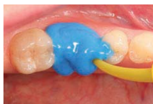
Fig. 5: Intra-oral syringing with Express™ 2 Light Body Flow Quick