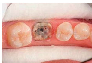
Fig. 2: Tooth 36 reinforced with 2 fiber posts, occlusal view