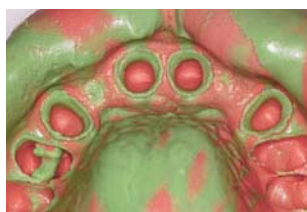
Fig. 5: Precision impression Express™ 2 Penta™ H & Express™ 2 Light Body Flow Impression Material