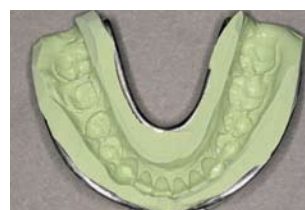
Fig. 4: Initial impression Express™ 2 Penta™ H Universal Quick after carving