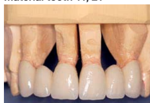
Fig. 10: Final bridge restoration on split cast model, buccal view