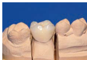
Fig. 7: Final Lava crown restoration on model, buccal view