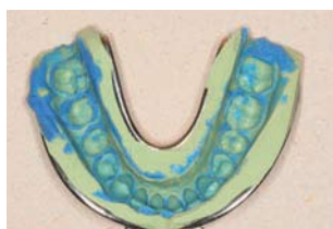
Fig. 6: Express™ 2 Penta™ H Universal Quick & Express™ 2 Light Body Flow Quick 2-step Impression Material