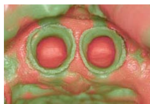
Fig. 6: Close-up precision impression Express™ 2 Penta™ H & Express™ 2 Light Body Flow Impression Material teeth 11, 21