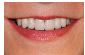
Fig. 12: Smiling patient with final restoration