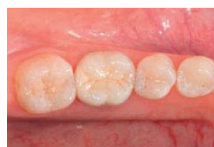
Fig. 12: Final Lava™ Crown in patients mouth, occlusal view