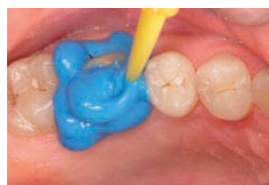
Fig. 3: Intra-oral syringing with Express 2 Light Body Flow Quick Impression Material