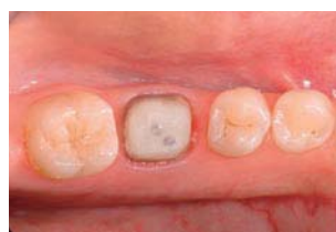
Fig. 3: Tooth 36 after core build-up and circular chamfer preparation for Lava™ Crown restoration, occlusal view