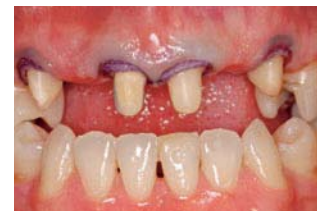
Fig. 4: Prepared teeth 13, 11, 21, 23 with retraction cords in place