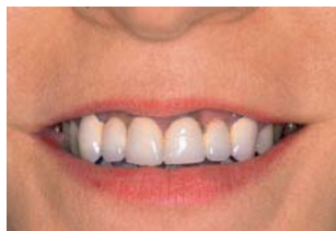
Fig. 1: Initial situation – Insufficient PFM bridges

After removal of the insufficient restorations and restorative pre-treatment a direct temporary bridge (3M™ ESPE™ Protemp™ 3 Garant™ Composite for Temporary Crowns and Bridges) was inserted (Fig. 3). Subsequently periodontal pre-treatment was performed. After a healing period of 3 months a chamfer preparation was carried out for the abutment teeth 13, 11, 21, 23. Ultrapak cords (Size 00, 0) have been placed for retraction of the gingival tissue in two-cord technique (Fig. 4). The precision impression using 1-step impression technique was done with 3M™ ESPE™ Express™ 2 Penta H and Express™ 2 Light Body Flow VPS Impression Materials (Fig. 5). Tray and wash materials offer a very good colour contrast allowing an excellent readability of all relevant details. Fig. 6 exhibits a detailed view of the upper central incisors showing that the preparation margins for both abutment teeth are entirely captured. Neither tears nor voids occurred at the preparation margins or at other relevant areas. A master model has been created (Fig. 7). Fig. 8 shows the precise fit of the high-gold alloy frameworks on the master model. The intra-oral try-in of the frameworks showed an excellent precision of fit (Fig. 9). After try-in of the firstly fired frameworks the PFM bridges with ceramic shoulders were glaze fired and finalised. (Fig. 10). The bridge restorations were permanently cemented with 3M™ ESPE™ RelyX™ Unicem Self-Adhesive Resin Cement (Fig. 11, 12).