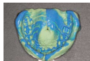
Fig. 4: Express 2 Penta H Quick & Express 2 Light Body Flow Quick Impression Material