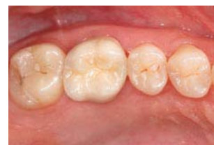
Fig. 8: Final Lava restoration inserted in mouth, occlusal view