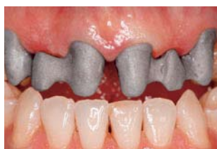
Fig. 9: Bridge frameworks in patient's mouth, buccal view