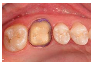
Fig. 2: Tooth 26 prepared, with retraction cords in place, occlusal view