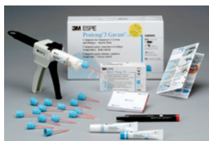
3M™ ESPE™ Protemp™ 3 Garant™ Temporization Material Starter Pack (46952)