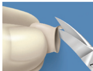
Trim following gingival contour

No impression or matrix. No dispensing hardware or mix tips.