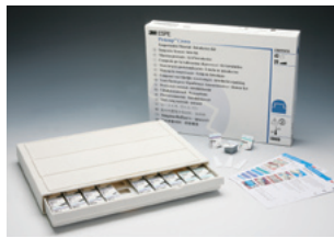
3M™ ESPE™ Protemp™ Crown Temporization Material Introductory Kit (50600)