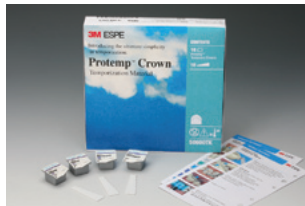
3M™ ESPE™ Protemp™ Crown Temporization Material Trial Kit (50600TK)