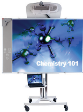
3M Digital Board 578 shown with 3M™ Super Close Projection SCP716 on Folding Wall Mount and SCP700 Series Mobile Stand V2 with attachable shelf option