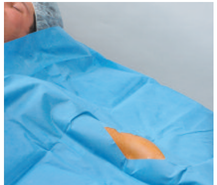
1192 Brachial/Radial Access