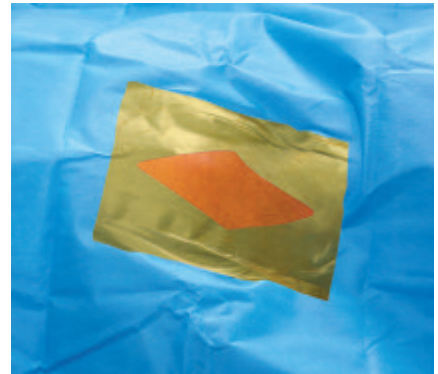
1192 drape with 6661EZ 3M™ Ioban™ 2 Antimicrobial Incise Drape