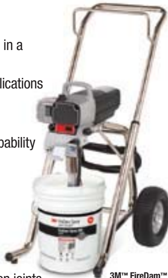
3M™ FireDam™ Spray 200 can be applied with conventional airless sprayers