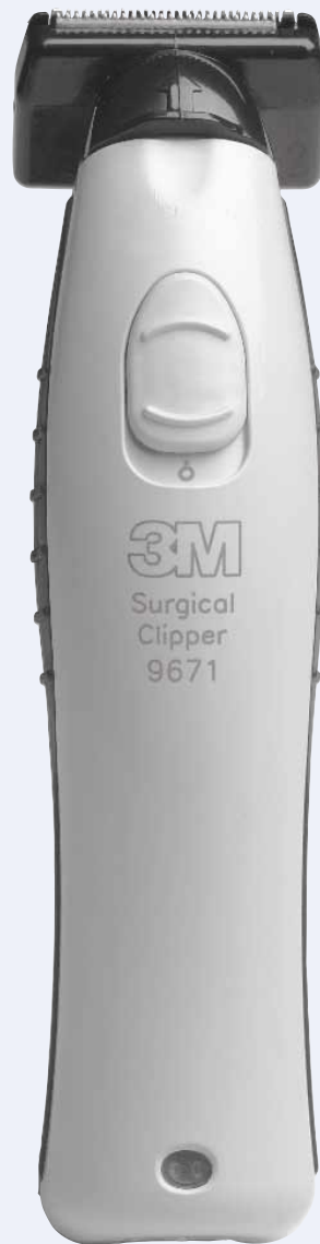
3M™ Surgical Clipper 9671 Fixed Head