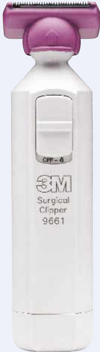
3M™ Surgical Clipper 9661 Pivoting Head