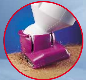
3M™ Surgical Clipper 9661 Pivoting Head