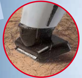
3M™ Surgical Clipper 9671 Fixed Head