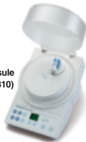
3M™ ESPE™ RotoMix™ Capsule Mixing Unit (76310)