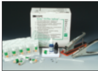
Ketac™ Fil Plus Aplicap™ Introductory Kit (55001)