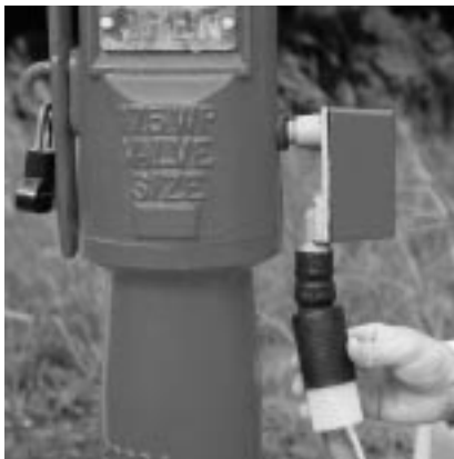
9 Addition of the cold shrink tubing forces the mastic into the threads and provides overall corrosion protection.

3M™ CPT Series Cold Shrink Corrosion Protection Kits are designed to provide a quick and easy method for protecting bulkhead termination connectors from the corrosive influences of wet and salt-fog installation environments.