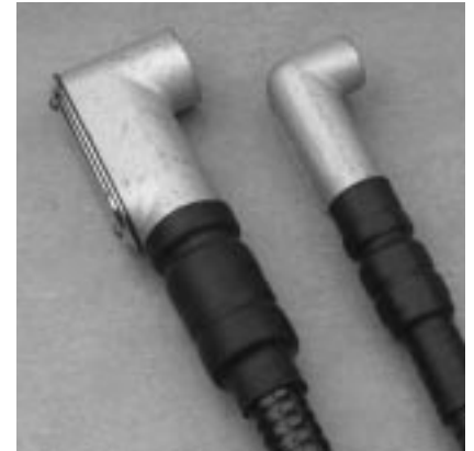
10 CPT kits are designed to fit metal clad jacketed cable connectors. (See connector cross reference chart on next page)