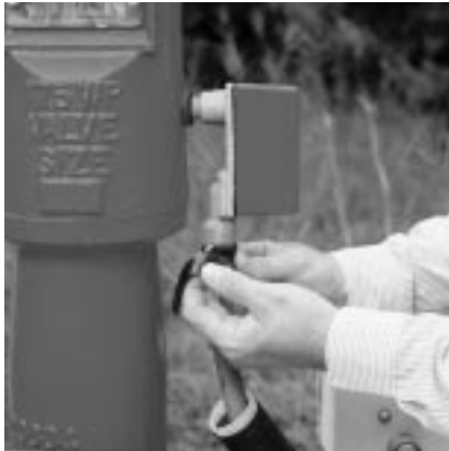
8 A mastic strip fills the exposed threads to enhance the environmental seal