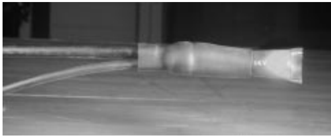
For easy identification, the preformed, slip-on rubber boot is now printed with 1kV or 5kV voltage ratings.