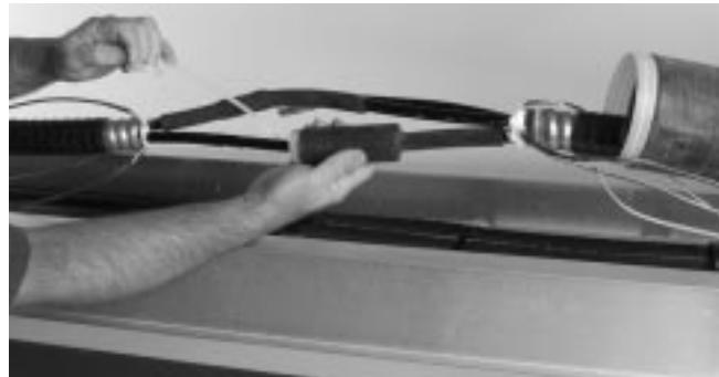
Cold shrink tubing provides the connector insulation as well as the cable re-jacketing (kits 5732-5735 only)

With the increased use of multi-conductor cable, your requirements for a reliable, watertight, permanent splice are met with the 5730 series splice kits. 3M cold shrink sleeves offer protection against moisture and contamination for inline splices. 3M Low Voltage Cold Shrink Splicing Kits are applicable for indoor and outdoor installations, including direct burial, aerial and submersible applications. The 5730 series accommodates a full range of cable sizes from #14 AWG-750 MCM. The overall jacket diameter ranges from 0.62" - 4.0" (16mm-102mm).